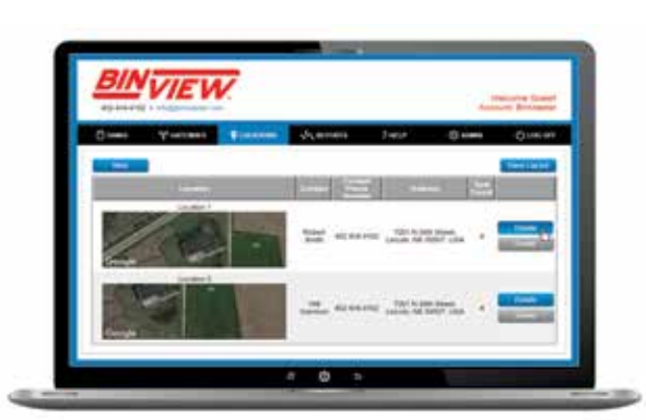
Location view on a PC