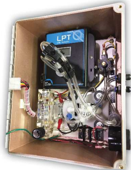
Inside of the DCC-MRI showing the LPT-A with Oxygen sensor.

CET-715A-SDP Sample Draw Pump Calibration Kit for 17, 34, 58, 74, 100 L cylinders, 1.0 LPM demand flow regulator & adapter to fit 17 L cylinder