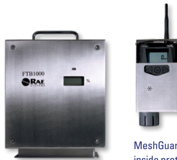
RAE PowerPak External Battery