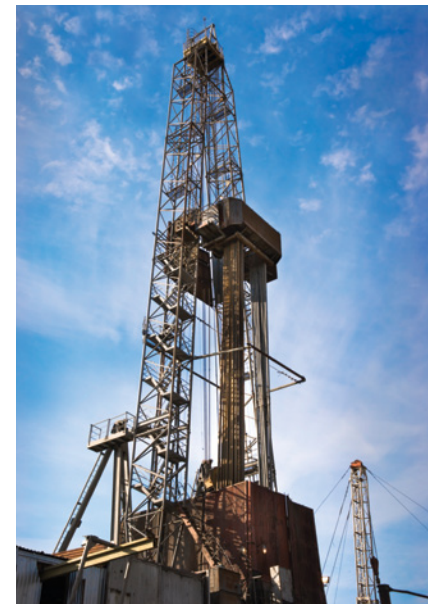
MeshGuard wireless gas detectors are designed for use in the harshest outdoor environments such as drilling rigs and in other industrial applications