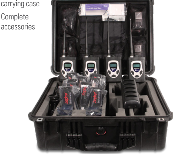
BioHarness Team Kit

BioHarness is a trademark of Zephyr Technology