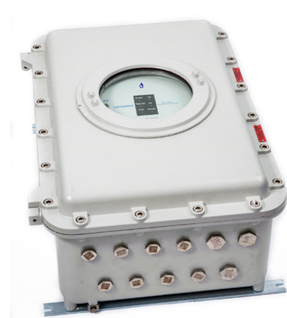
SLC-220/MULTI in Exd enclosure, without LCD