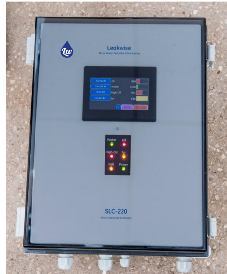
SLC-220/MULTI in NEMA 4 enclosure, with LCD