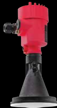
Lightweight Plastic Antenna Option