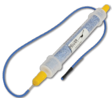
Drying Tube Assembly