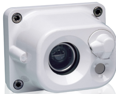
Typical applications: aircraft hangars, fuel transfer stations, compressor stations, silane storage bunkers, paint spray booths and gas cabinets.

The model 860 is available in two versions, one for hydrocarbon fires only, and one for hydrocarbon and certain non-hydrocarbon fires. This dual capability provides the unique capability of providing fire detection for a broad range of fuels with a single unit. Both versions are available with an automatic self-test function to monitor the detector's ability to sense fires, and report a fault condition when impaired.