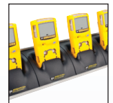
Five unit cradle charger

For a complete list of accessories, please contact BW Technologies by Honeywell.