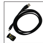
IR connectivity kit