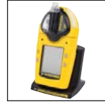
Integral pump and battery charger