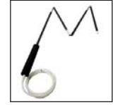
Collapsible sampling probe

For a complete list of accessories, please contact BW Technologies.