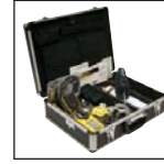
Confined space kit