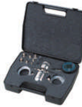
Low pressure pneumatic test kit

Includes DPI 104-IS; ranges to 10,000 psi (700 bar), PV 411A combined pneumatic and hydraulic test pump, hydraulic reservoir, hose, adaptors, seal kit and case