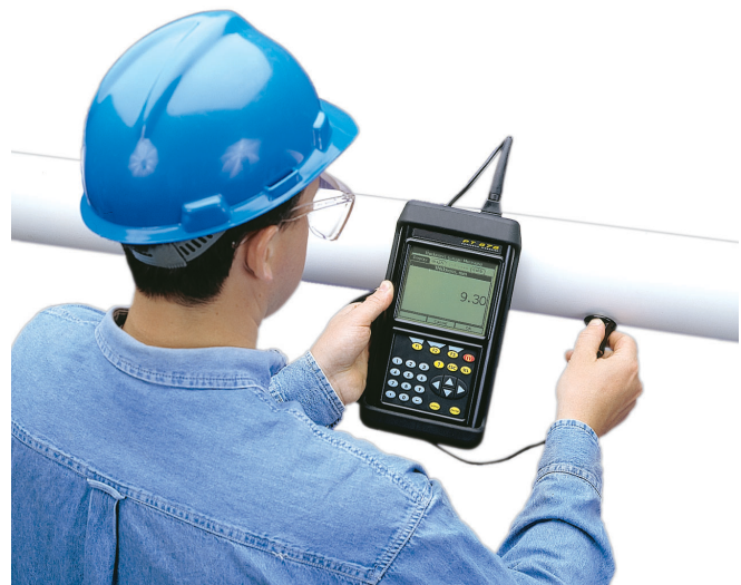
PT878 thickness-gauge option

Continuous operation to 100°F (37°C); intermittent operation to 500°F (260°C) for 10 sec followed by 2 min air cooling