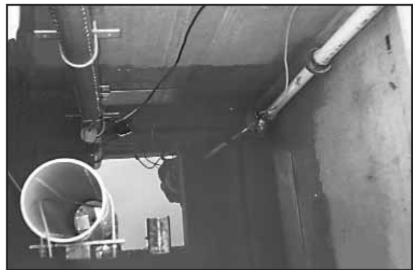
An ID-223 installed in a sump near a transformer substation.

In large cities, high voltage power cables are run underground. These cables are insulated with large quantities of oil, which is constantly pumped along the cable through underground pumps. Transformers are installed in building cellars and in underground vaults. The access to these cables and supporting equipment is through manholes. The underground cable service manholes can fill up with water and utility maintenance teams have to pump the water out into the drainage system. If oil is detected, the water has to be removed for treatment. Oil detection can be done either in a fixed installation of Leakwise ID-221 or ID-223 Detectors or by manually using a transportable ID-223 Oil Sheen Detector, that can be operated by 12 VDC from the service trucks.